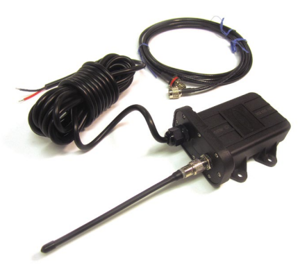
Power Requirement: 12/24v Dimensions: 4.5"W x 3.75 "H x 1.5"D Weight: 0.5lbs.

SmartLink™ One-Click™ Transceiver 36660C-35-0TR